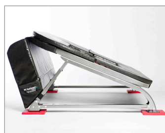
• 60055 Dorado® Bumper