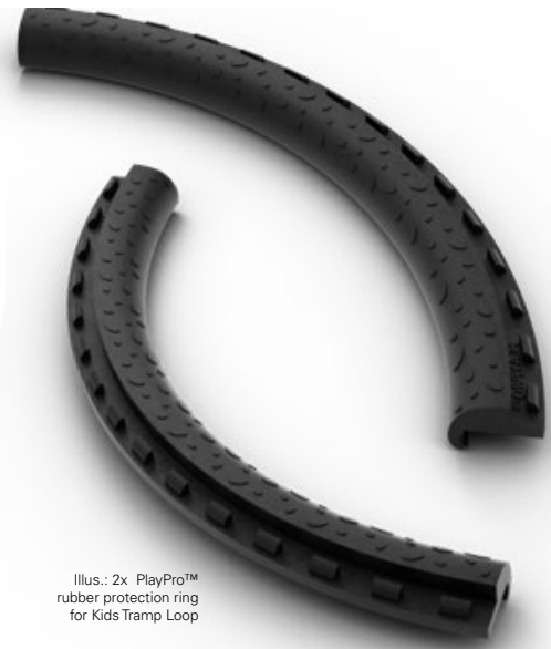
Illus.: 2x PlayPro™ rubber protection ring for Kids Tramp Loop