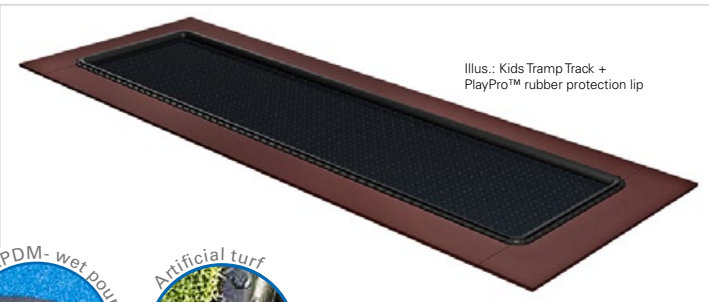
Illus.: Kids Tramp Track + PlayPro™ rubber protection lip