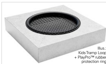
Illus.: Kids Tramp Loop + PlayPro™ rubber protection ring