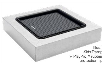
Illus.: Kids Tramp + PlayPro™ rubber protection lip