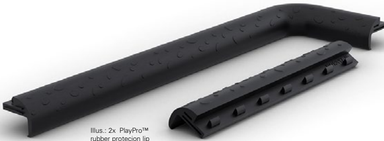
Illus.: 2x PlayPro™ rubber protection lip for Kids Tramp & Kids Tramp Track